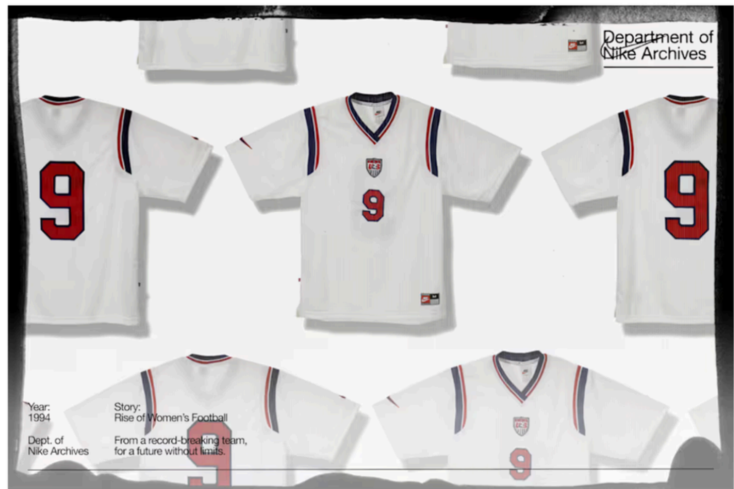
Department of Nike Archives Never Done Rising