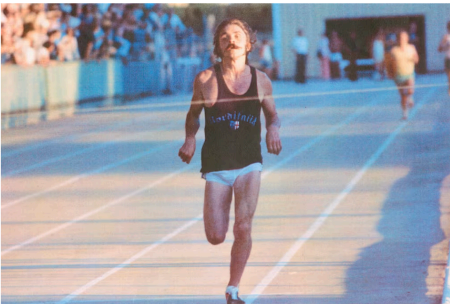
Department of Nike Archives Rebels Are Never Done