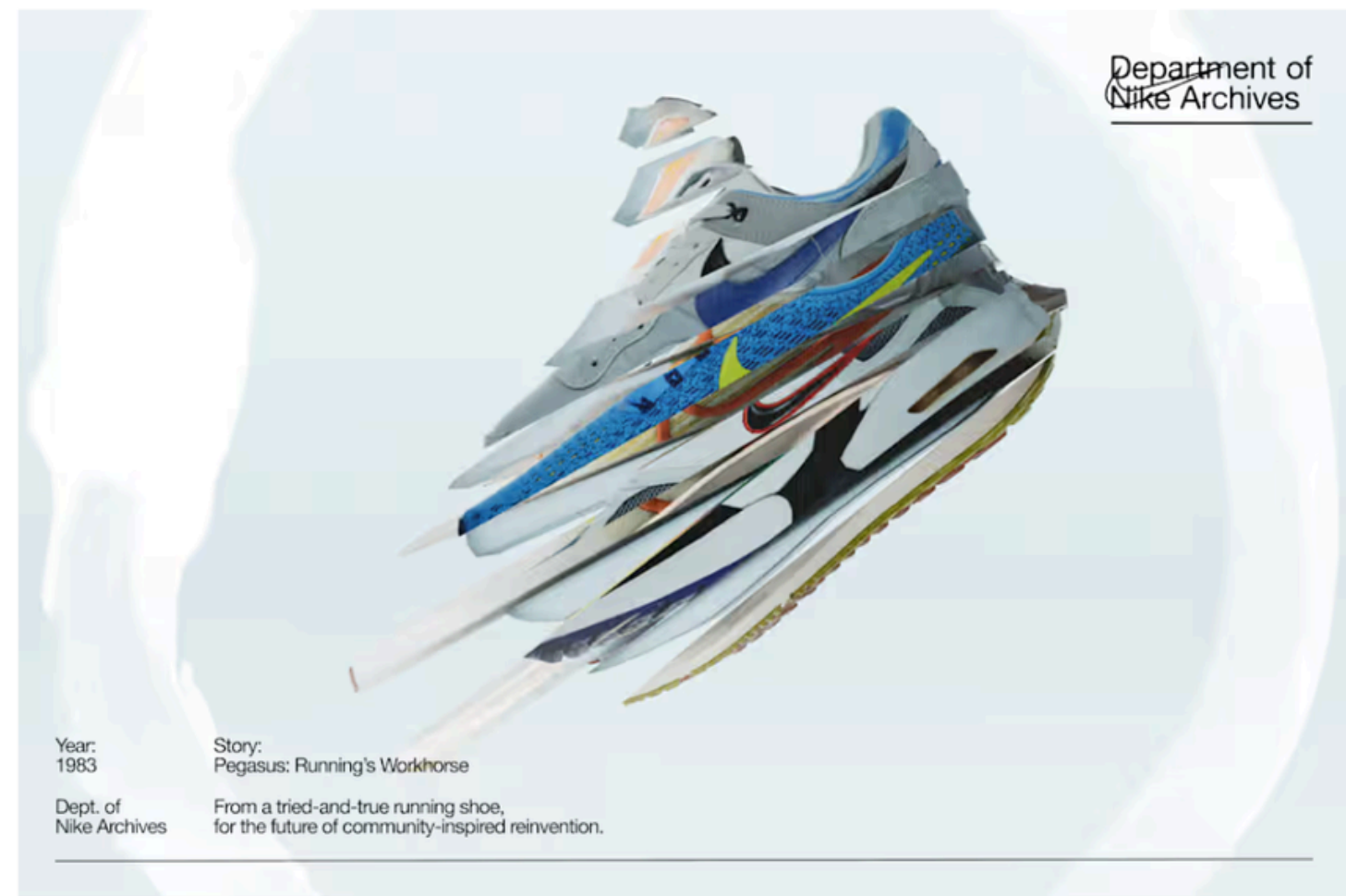
Department of Nike Archives Never Done Iterating